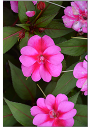
SunPatiens Compact Purple Candy Impatiens flowers

SunPatiens Compact Purple Candy Impatiens is recommended for the following landscape applications;