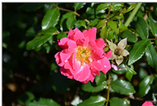
Oso Easy Double Pink Rose flowers