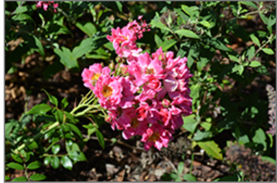
Oso Easy Double Pink Rose flowers

* This is a 'special order' plant - contact store for details