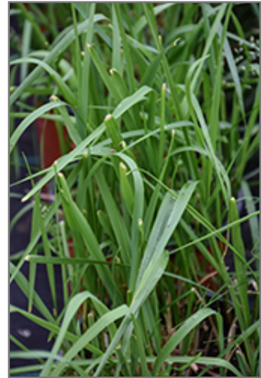
Sweet Grass foliage

An erect, slender, sweet smelling aromatic grass, producing small seed heads bearing broad, copper colored spikelets; it is considered a sacred herb by indigenous peoples in North America; extremely hardy, and will cover an area by spreading rhizomes