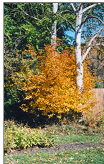
Saskatoon in fall