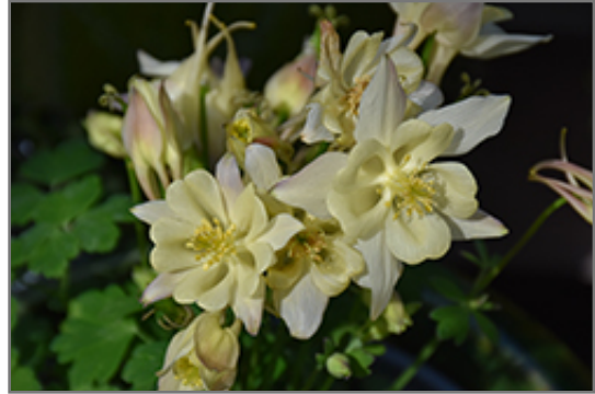
Earlybird Yellow Columbine flowers

Earlybird Yellow Columbine is recommended for the following landscape applications;