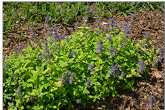
Chartreuse On The Loose Catmint in bloom