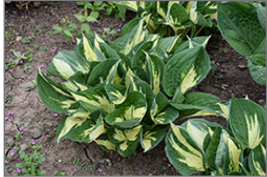
Pathfinder Hosta