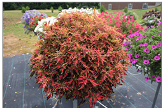
ColorBlaze Mini Me Watermelon Coleus