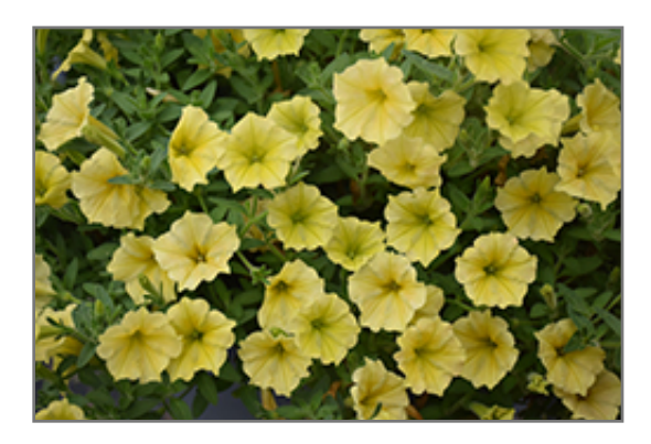
Supertunia Mini Vista Yellow Petunia flowers

Supertunia Mini Vista Yellow Petunia is recommended for the following landscape applications;