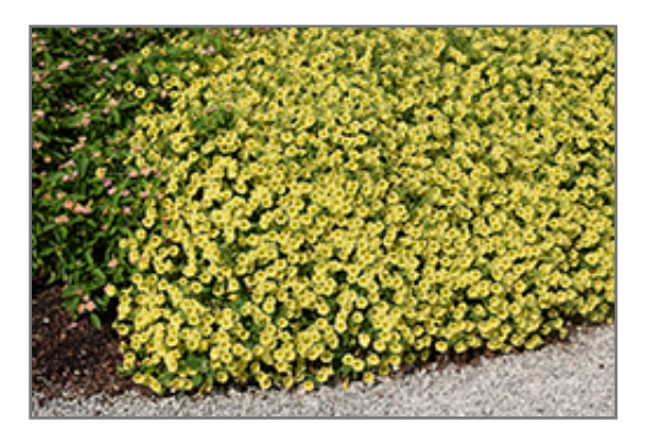
Supertunia Mini Vista Yellow Petunia in bloom