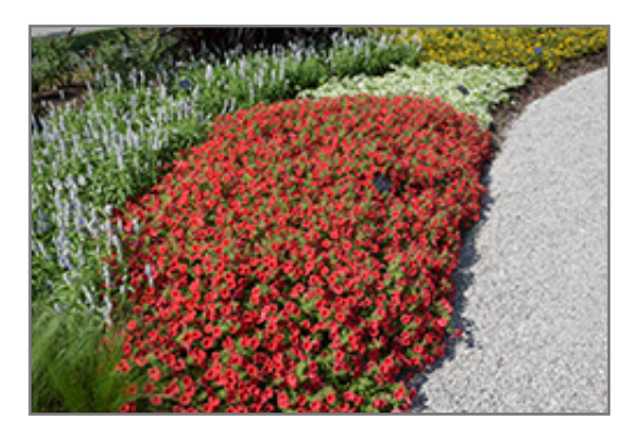
Supertunia Mini Vista Scarlet Petunia in bloom