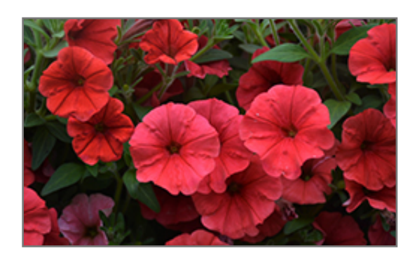
Supertunia Mini Vista Scarlet Petunia flowers

Supertunia Mini Vista Scarlet Petunia is recommended for the following landscape applications;