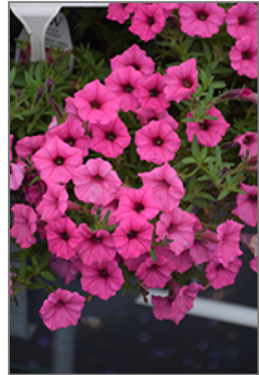
Supertunia Mini Vista Hot Pink Petunia flowers

Supertunia Mini Vista Hot Pink Petunia is recommended for the following landscape applications;