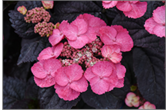
Pink Dynamo Hydrangea flowers

Pink Dynamo Hydrangea is recommended for the following landscape applications;