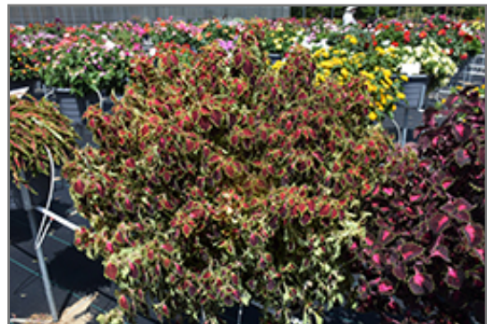
TrailBlazer Glory Road Coleus