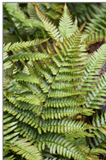
Autumn Fern foliage

Autumn Fern is recommended for the following landscape applications;