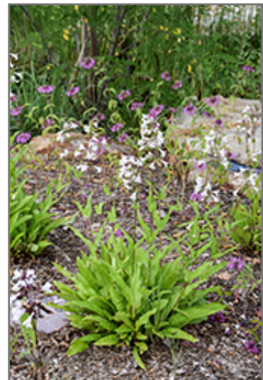
Foxglove Beardtongue in bloom