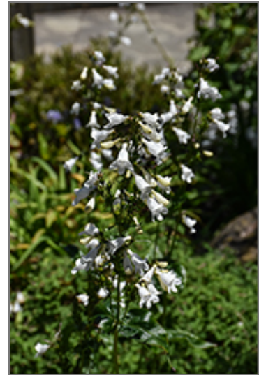
Foxglove Beardtongue flowers

Foxglove Beardtongue is recommended for the following landscape applications;