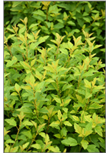
Raspberry Lemonade Ninebark foliage

Raspberry Lemonade Ninebark is recommended for the following landscape applications;