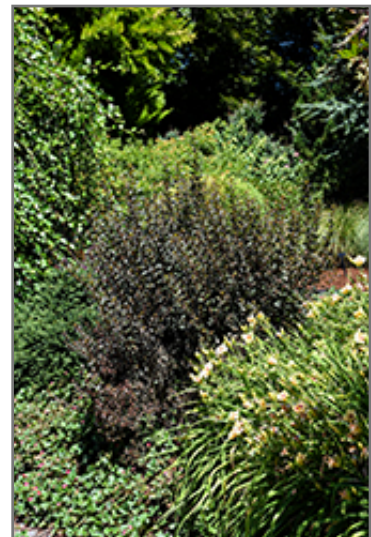
Little Joker Ninebark