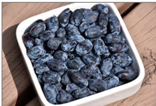
Boreal Beast Honeyberry fruit

This is a dense multi-stemmed deciduous shrub with a more or less rounded form. Its average texture blends into the landscape, but can be balanced by one or two finer or coarser trees or shrubs for an effective composition. This plant will require occasional maintenance and upkeep, and is best pruned in late winter once the threat of extreme cold has passed. It is a good choice for attracting butterflies to your yard. It has no significant negative characteristics.