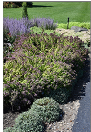
Drops of Jupiter Oregano in bloom