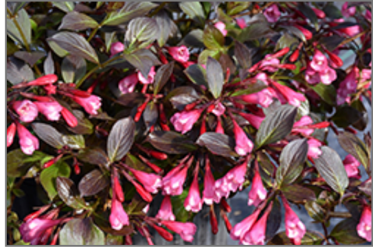
Very Fine Wine Weigela flowers

Very Fine Wine Weigela is recommended for the following landscape applications;