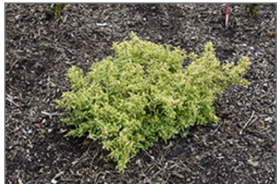
Bubbly Wine Weigela