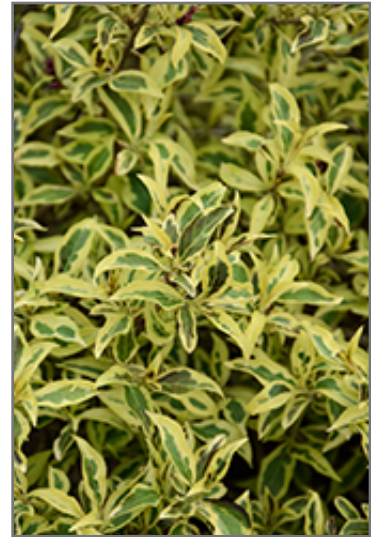
Bubbly Wine Weigela foliage

Bubbly Wine Weigela is recommended for the following landscape applications;