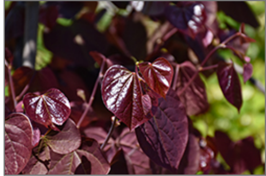
Midnight Express Redbud foliage