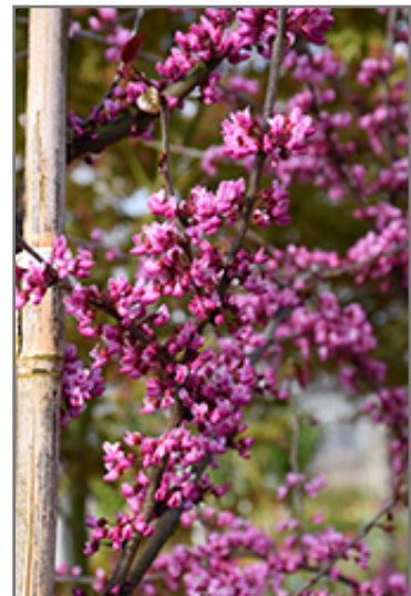
Midnight Express Redbud flowers