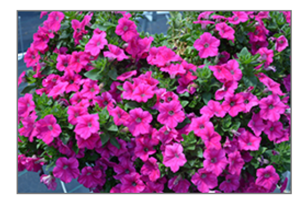
Sweetunia Hot Pink Petunia in bloom

Sweetunia Hot Pink Petunia is recommended for the following landscape applications;