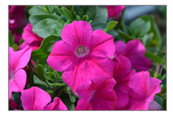
Sweetunia Hot Pink Petunia flowers