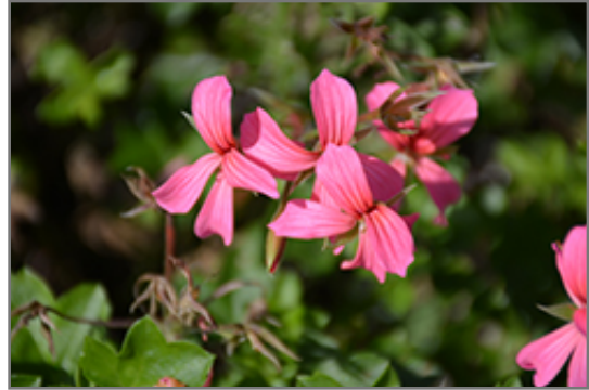
Minicascade Pink Ivy Leaf Geranium flowers

This plant will require occasional maintenance and upkeep. Trim off the flower heads after they fade and die to encourage more blooms late into the season. It is a good choice for attracting bees and butterflies to your yard. It has no significant negative characteristics.