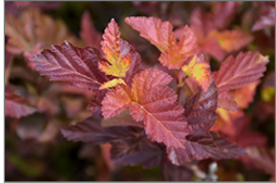
Center Glow Ninebark foliage

Center Glow Ninebark is recommended for the following landscape applications;