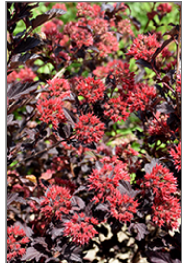
Center Glow Ninebark fruit