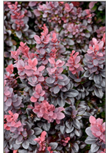
Concorde Japanese Barberry foliage