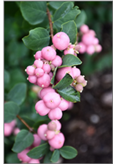
Pinky Promise Snowberry fruit

Pinky Promise Snowberry is recommended for the following landscape applications;