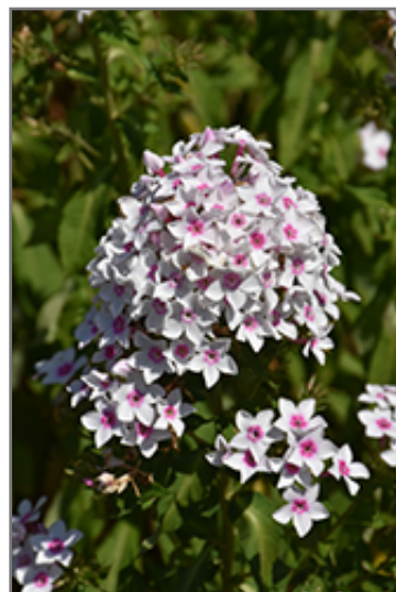
Cherry Cream Garden Phlox flowers