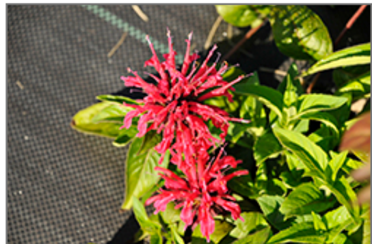
BeeMine Red Beebalm flowers