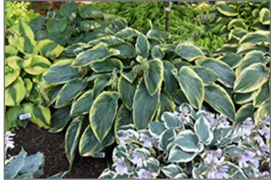
Shadowland Wu-La-La Hosta

This is a relatively low maintenance plant, and is best cleaned up in early spring before it resumes active growth for the season. Gardeners should be aware of the following characteristic(s) that may warrant special consideration;