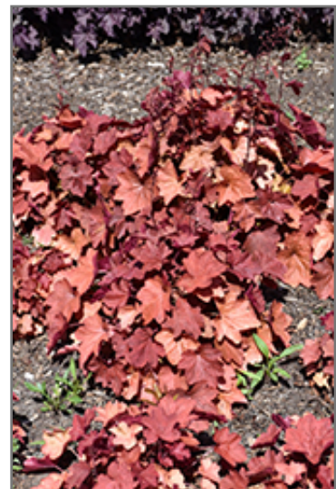
Carnival Cinnamon Stick Coral Bells