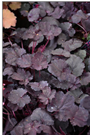
Black Forest Cake Coral Bells foliage