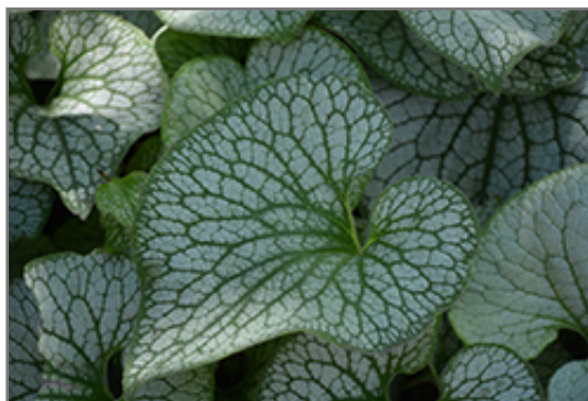
Sterling Silver Bugloss foliage

Sterling Silver Bugloss will grow to be about 12 inches tall at maturity, with a spread of 24 inches. When grown in masses or used as a bedding plant, individual plants should be spaced approximately 20 inches apart. It grows at a medium rate, and under ideal conditions can be expected to live for approximately 10 years. As an herbaceous perennial, this plant will usually die back to the crown each winter, and will regrow from the base each spring. Be careful not to disturb the crown in late winter when it may not be readily seen!