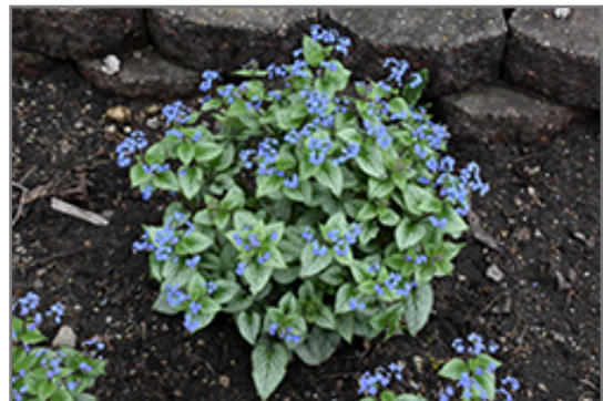
Sterling Silver Bugloss in bloom