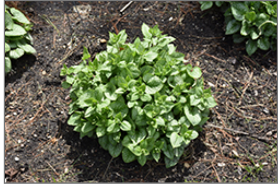
Jack of Diamonds Bugloss

Jack of Diamonds Bugloss will grow to be about 14 inches tall at maturity, with a spread of 30 inches. When grown in masses or used as a bedding plant, individual plants should be spaced approximately 28 inches apart. It grows at a medium rate, and under ideal conditions can be expected to live for approximately 10 years. As an herbaceous perennial, this plant will usually die back to the crown each winter, and will regrow from the base each spring. Be careful not to disturb the crown in late winter when it may not be readily seen!