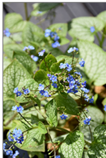
Jack of Diamonds Bugloss flowers

Jack of Diamonds Bugloss is recommended for the following landscape applications;