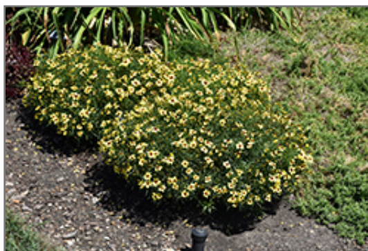
Sizzle And Spice Sassy Saffron Tickseed in bloom