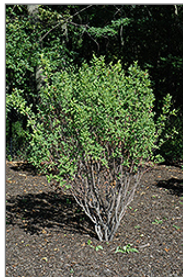
Rainbow Pillar Serviceberry

This is a relatively low maintenance shrub, and should not require much pruning, except when necessary, such as to remove dieback. It is a good choice for attracting birds to your yard, but is not particularly attractive to deer who tend to leave it alone in favor of tastier treats. It has no significant negative characteristics.