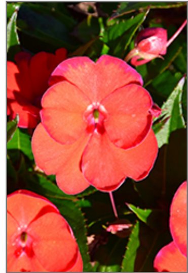
SunStanding Orange Aurora Impatiens flowers

SunStanding Orange Aurora Impatiens is recommended for the following landscape applications;