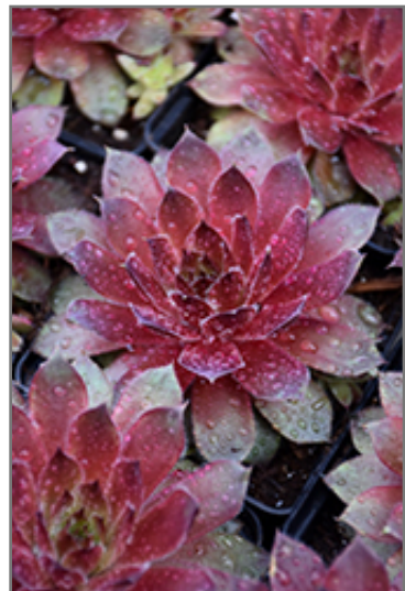
More Honey Hens And Chicks