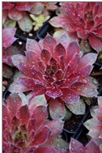
More Honey Hens And Chicks