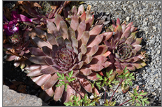
Kalinda Hens And Chicks