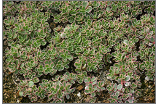
Tricolor Stonecrop flowers

Tricolor Stonecrop will grow to be only 4 inches tall at maturity, with a spread of 18 inches. When grown in masses or used as a bedding plant, individual plants should be spaced approximately 15 inches apart. Its foliage tends to remain low and dense right to the ground. It grows at a fast rate, and under ideal conditions can be expected to live for approximately 10 years. As an herbaceous perennial, this plant will usually die back to the crown each winter, and will regrow from the base each spring. Be careful not to disturb the crown in late winter when it may not be readily seen!