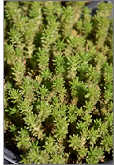
Six Row Stonecrop foliage

Six Row Stonecrop is a fine choice for the garden, but it is also a good selection for planting in outdoor pots and containers. Because of its spreading habit of growth, it is ideally suited for use as a 'spiller' in the 'spiller-thriller-filler' container combination; plant it near the edges where it can spill gracefully over the pot. Note that when growing plants in outdoor containers and baskets, they may require more frequent waterings than they would in the yard or garden. Be aware that in our climate, most plants cannot be expected to survive the winter if left in containers outdoors, and this plant is no exception. Contact our experts for more information on how to protect it over the winter months.