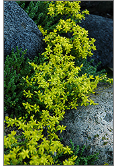
Six Row Stonecrop flowers