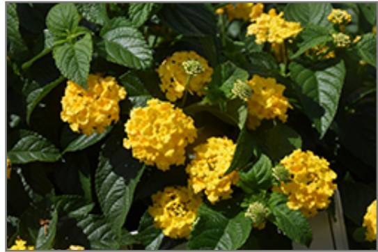
Lucky Yellow Lantana flowers

Lucky Yellow Lantana is recommended for the following landscape applications;