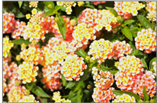
Lucky Peach Lantana flowers

Lucky Peach Lantana is recommended for the following landscape applications;