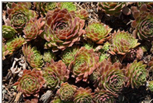
Rocknoll Rosette Hens And Chicks