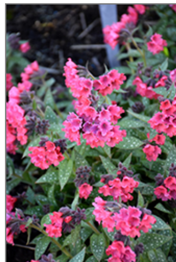
Shrimps On The Barbie Lungwort flowers

This is a relatively low maintenance plant, and should be cut back in late fall in preparation for winter. It is a good choice for attracting bees, butterflies and hummingbirds to your yard, but is not particularly attractive to deer who tend to leave it alone in favor of tastier treats. It has no significant negative characteristics.