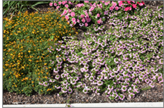
Surdiva Classic Pink Fan Flower flowers

Surdiva Classic Pink Fan Flower will grow to be about 10 inches tall at maturity, with a spread of 24 inches. When grown in masses or used as a bedding plant, individual plants should be spaced approximately 18 inches apart. Its foliage tends to remain low and dense right to the ground. This fast-growing annual will normally live for one full growing season, needing replacement the following year.