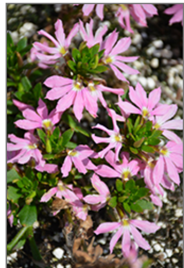
Surdiva Classic Pink Fan Flower flowers