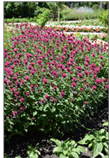
Raspberry Wine Beebalm in bloom