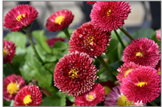
Tasso Red English Daisy flowers

Tasso Red English Daisy is recommended for the following landscape applications;