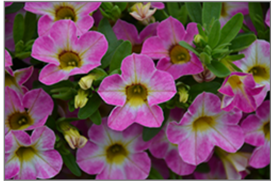
Chameleon Starlet Pink Calibrachoa flowers

Chameleon Starlet Pink Calibrachoa is a dense herbaceous annual with a trailing habit of growth, eventually spilling over the edges of hanging baskets and containers. Its medium texture blends into the garden, but can always be balanced by a couple of finer or coarser plants for an effective composition.