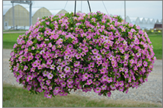
Chameleon Starlet Pink Calibrachoa in bloom