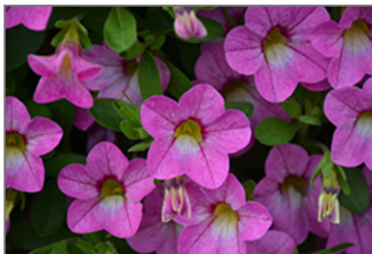
Chameleon Pink Diamond Calibrachoa flowers

Chameleon Pink Diamond Calibrachoa is a dense herbaceous annual with a trailing habit of growth, eventually spilling over the edges of hanging baskets and containers. Its medium texture blends into the garden, but can always be balanced by a couple of finer or coarser plants for an effective composition.