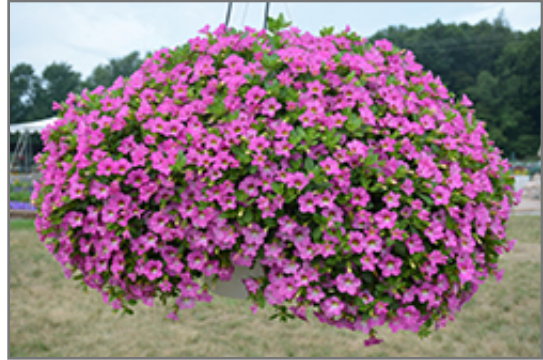
Chameleon Pink Diamond Calibrachoa in bloom